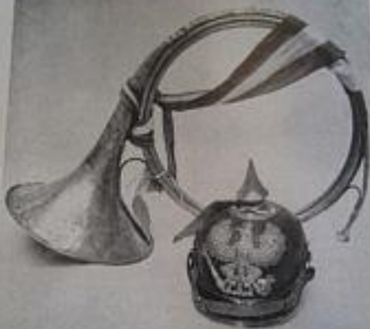
MARTIAL SOUVENIRS turned up in great number among grfs. German soldier's helmet was picked up on battlefield by Frenchman in World War I.