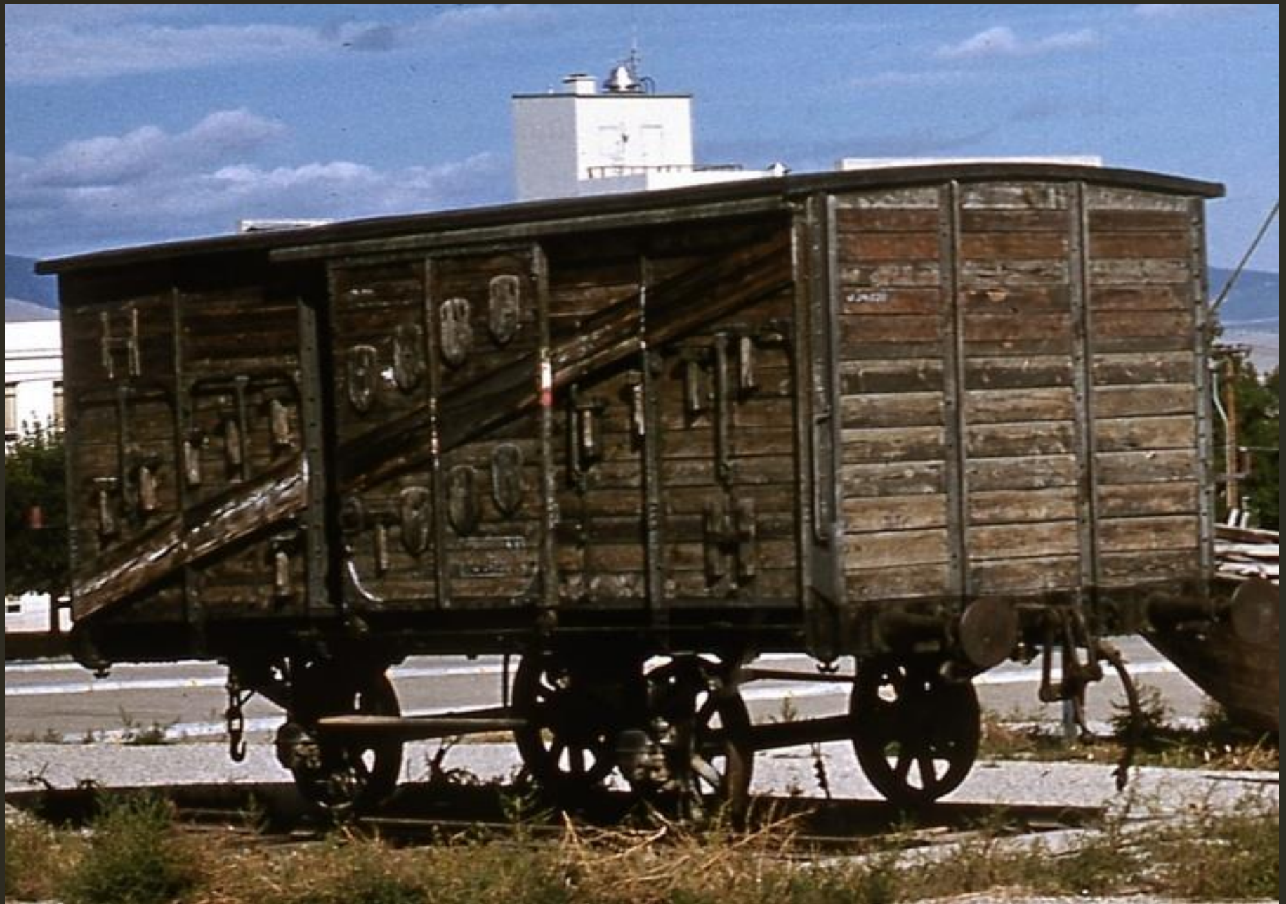
Montana MERCI Car as it looked in 1953 when transferred Montana Grand Du Montana 40 & 8