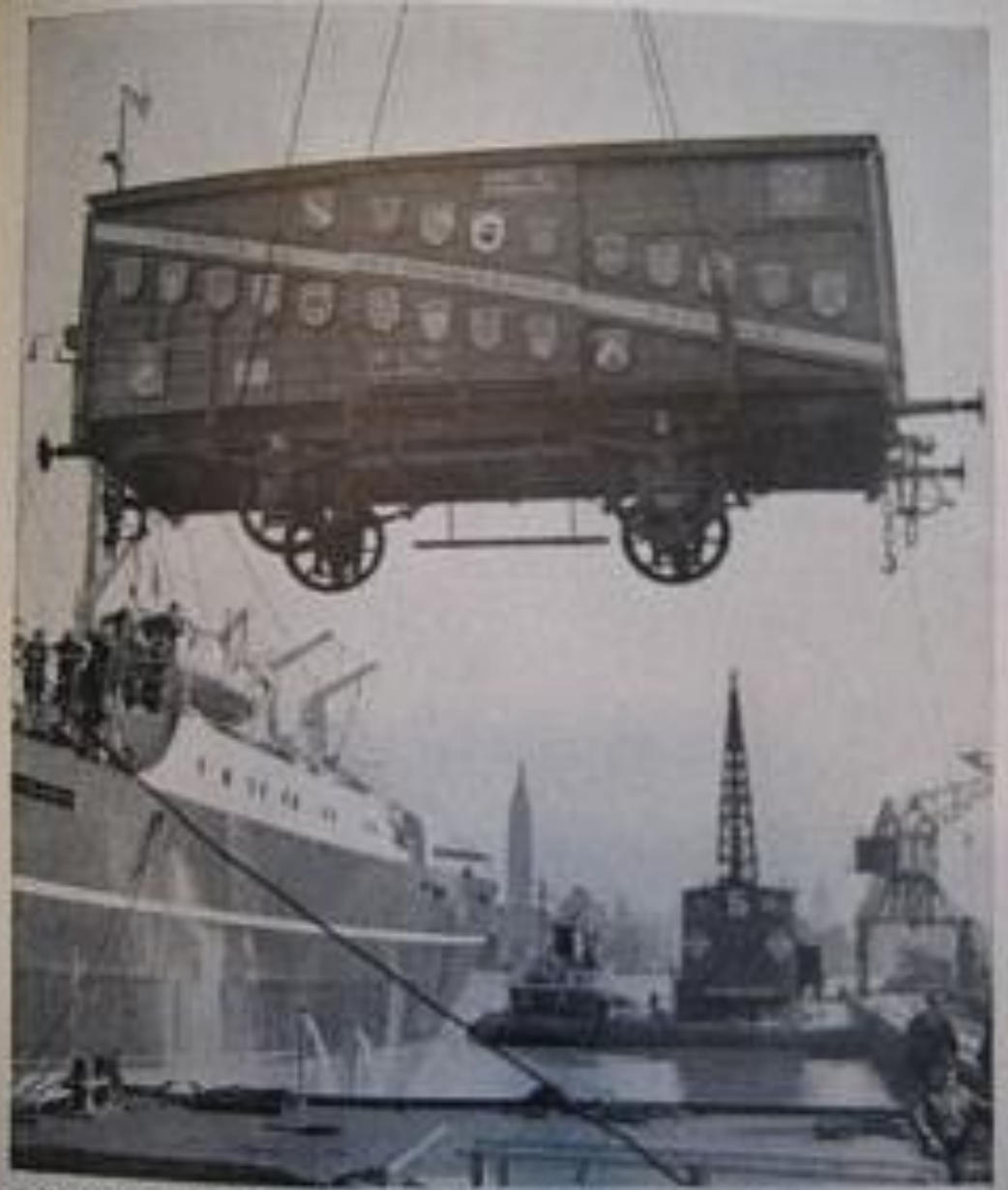
A "40 AND 8" CAR, adorned with the shields of France's provinces, is unloaded in New York Harbor. Its gauge is too narrow to fit railways in the U.S.