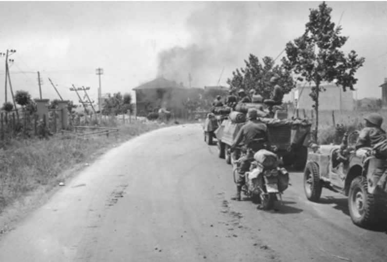
Task Force Ellis (91st Reconnaissance Squadron), a competitor to Task Force Howze, drives into the outskirts of Rome on 4 June 1944. In the center of the photo is an M-4 Sherman tank hit by a German 88mm self-propelled gun. Standard practice would have the tanks, tank destroyers, and armored cars support by fire while infantry flanked the position. In the assault on Rome, as soon as the enemy was destroyed or withdrew, the task force would resume its drive toward the Italian capital.

Undaunted, Radcliffe's group continued to press toward its objective—Rome. By nightfall, the group was within sight of the city, but some German tanks near a series of radio towers blocked its way. After a short, but