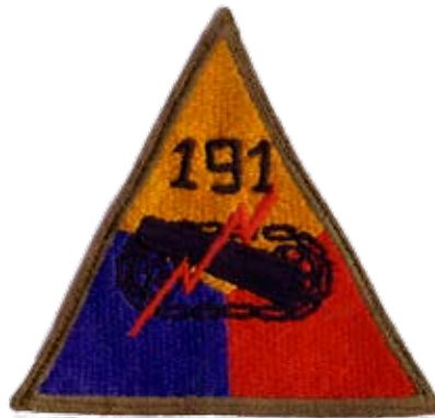
191st Tank Battalion