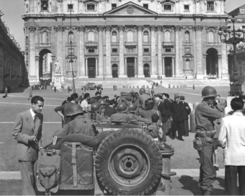
A Fifth Army reconnaissance patrol outside of Saint Peter's Cathedral.