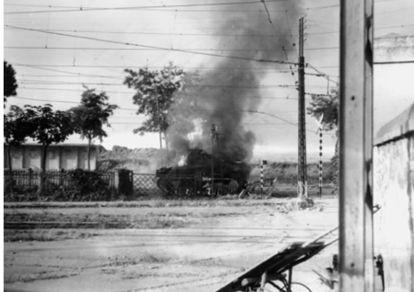
The first American tank (An M-4 Sherman tank from Task Force Howze) to enter Rome burns after a German ambush near the Pietralata rail yards on 4 June 1994.