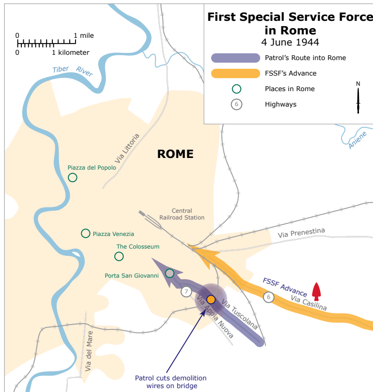
Route Radcliffe's patrol took into Rome with railway overpass area highlighted. The patrol cut demolition charge wires before entering Rome.

The patrol passed through the Porta San Giovanni for a second time. Five hundred meters into the city, some friendly Italian civilians stopped the patrol to warn them of German tanks ahead. Radcliffe's scouts confirmed one Tiger tank, but as the main force turned to pull back, a second Tiger tank suddenly blocked its withdrawal. The soldiers were trapped, caught like a baseball runner between home plate and third base in a squeeze play! With no anti-tank weapons capable of knocking out a Tiger tank, their only defense was to use the tight urban terrain to mask the tank fire. They did have a twelve-foot high wall to their rear and an embankment to the front which limited tank movement. The soldiers scattered to hide in the buildings. Whenever the vehicles attempted