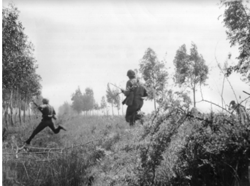
A FSSF patrol breaks contact after a successful ambush at Anzio 14 April 1944.