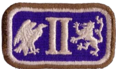
II Corps shoulder patch

Operation BUFFALO, the initial breakout from the Anzio beachhead, was preceded by a tremendous artillery barrage and naval gunfire at 0545 on 23 May. 13 In the breakout, the FSSF mission was to screen the right flank of VI Corps as it moved north toward Valmontone and Highway 7. To accomplish the screening mission, the FSSF had several heavy units: the 645th Tank Destroyer Battalion (-) and two companies of M-4 Sherman tanks from the 191st Tank Battalion were attached. 14 The 463rd Parachute Field Artillery Battalion’s 75mm howitzers provided direct-fire support. 15 As the FSSF moved northward, the Japanese-American 100th Battalion screened its far right flank. 16 Ten days after the breakout, the FSSF was