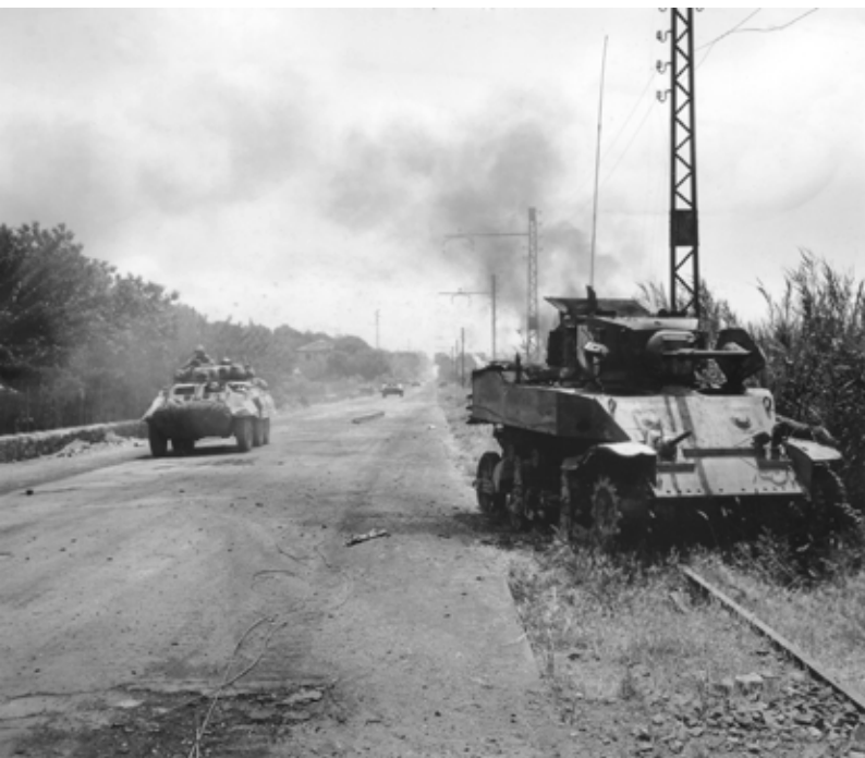
Armored cars of Task Force Howze move past a burning American M3 Stuart light tank that was just knocked out in the push to Rome on 4 June 1944. Several competing task forces wanted to be the first into the Italian capital.

fierce fight, the Germans withdrew under cover of darkness. This enabled Radcliffe to quarter his patrol for the night in a movie studio complex off Via Tuscolana in the Appio Latino section of Rome. The soldiers discovered afterwards that they had camped in the "Hollywood of Italy," the Cinecittà movie studio, built in the late 1930s. While Radcliffe's force rested, lead elements of Task Force Howze continued to attack. 25 By dawn, the tanks and tank destroyers of Task Force Howze had opened a route into Rome. 26