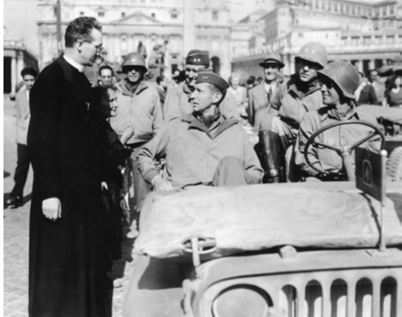
Lieutenant General Mark Clark in Rome.