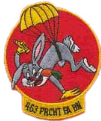
463rd Parachute Artillery Battalion

Units attached to the FSSF for the assault on Rome.